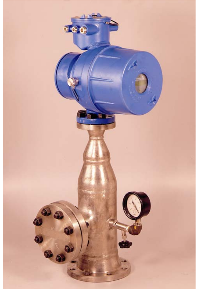
Servo Gauge fitted on High Pressure Calibration Chamber