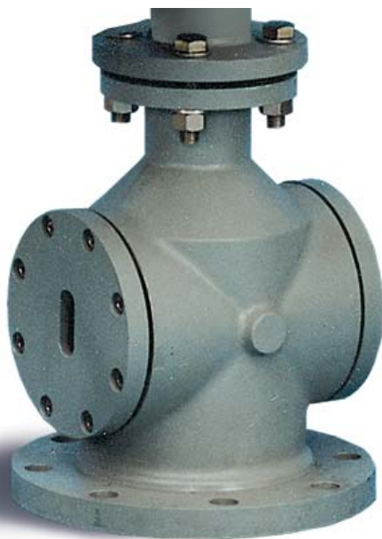
Calibration Chamber for Low Pressure Applications